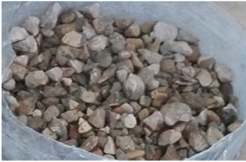
Fig. 1: Recycled Concrete aggregate