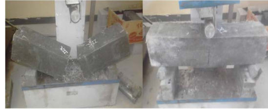
Fig. 2: Flexural test

Experimental work: The experimental testing was conducted in the concrete laboratory of the Faculty of Engineering at BaniWaleed University, Libya. Twenty concrete samples were made with and without using recycled aggregate concrete. In this study, twelve 150 mm side cubes with a compressive strength of 30 Mpa and eight prisms with flexural strength of 2.65 Mps were used as samples (Fig. 2). The nominal mixing proportion utilized for making the samples (cement: sand: coarse aggregate) by weight with slump of (180±5) mm as a base to get constant workability for all samples were designed. The recycled aggregate concrete was submerged in water for 24 h and later dried to get saturated surface dry conditions. Sand, cement and normal coarse aggregate or recycled aggregate concrete were mixed in a dry state before the necessary amount of water (0.45%) was added and mixed thoroughly. Oil was brushed on the inner surfaces of the wooden mold before casting. Three layers of concrete were poured into the mold and compacted thoroughly using a standard compact Immersion Vibrators. The top surface was done using a trowel. The samples were removed from the mold after 24 h and then