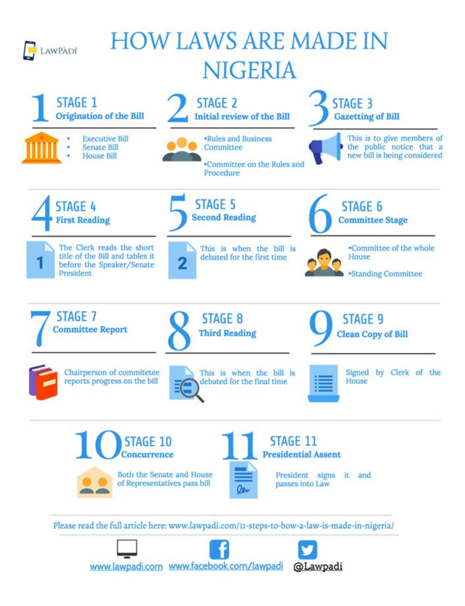
Fig. 2: Nigeria legislative making template